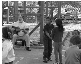
Dancing at the Miquon School